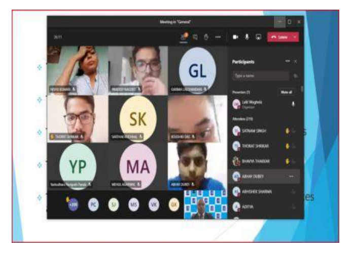
Online Cuisine demonstration – pic 5