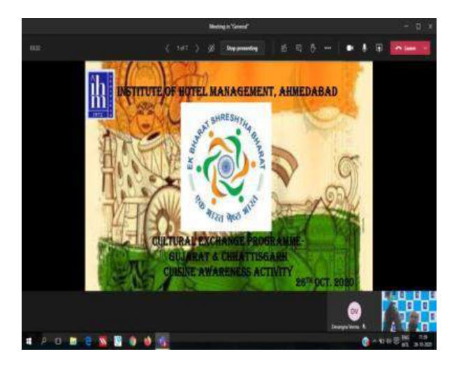
Online Cuisine demonstration Videos (Pic 1)