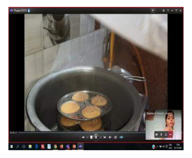
Online Cuisine demonstration Videos (Pic 4)