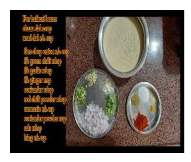
Online Cuisine demonstration – Bafauri (Pic 2)