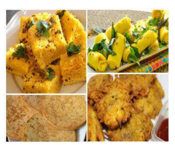
Snacks of Gujarat (Pic 6)